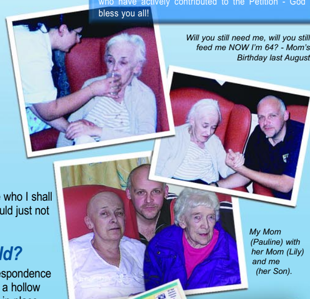
Will you still need me, will you still feed me NOW I'm 64? - Mom's Birthday last August