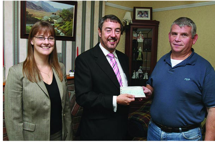
Standing up for the rights of people denied PCT Continuing Care funding.

For the best part of 40 years, this created no problems and everyone knew where they stood but healthcare is an expensive business. With increasing demands on the NHS and a genuine desire to provide better care for the wide category of patients, changes were made. To ease the pressure on the number of beds available it was decided that many could be moved out into local authority or private sector Nursing Homes. It was at this point that the brave new world started to crumble.